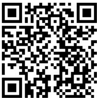
Google Scholar Page